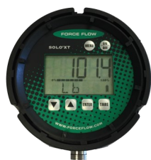
SOLO XT™ Battery & Loop Powered