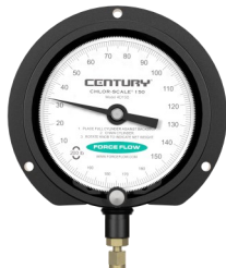
CENTURY™ DIAL No Power Required

The Hydraulic Carboy-Scale is ordered as a complete weighing system, including a SOLO XT™ digital display or analog CENTURY™ Dial weight indicator.